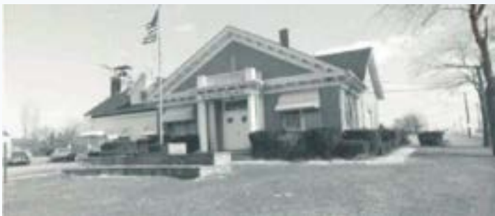
Original Seven Hills City Hall Built 1940

Seven Hills Historical Society Meetings are held the first Wednesday of each month in the Historical Society Room at City Hall from Noon - 2pm.