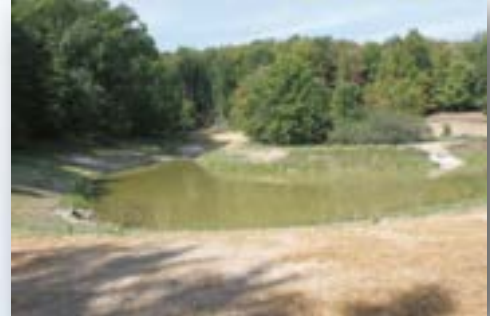
Somerset Basin After

In addition, the dredging of Driftwood Basin (located between Chestnut and Driftwood at the southern edge of the Bayberry development) is nearly complete. These basins are an integral part of our storm water management system. They capture storm water and retain it until the sewers can convey it. It is important that they be maintained and are working properly. These basins are now functioning at the level they were designed, thereby relieving a lot of the overland flooding that occurs when they are not.