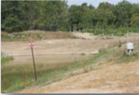
Somerset Basin Before

The Calvin Park Stormwater Basin (located adjacent to Somerset Drive) was recently rehabilitated by the city. The existing stream channel was reinforced with armor rocks (erosion control system), as well as removal of approximately three feet (3') of sediment from the basin to restore storm water storage capacity in this basin. Nearly 500 trees and plants were added to the project to help reforest the area.