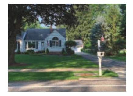
Example of a "Neat and Tidy" home on Crossview Road

Increased property values result when homes are near well-maintained parks, which in turn enhances the value of the local tax base. Besides promoting health and wellness, better amenities and parks equal better economic development. Improved property value support equals more revenues and lower overall taxes for all of us long term.